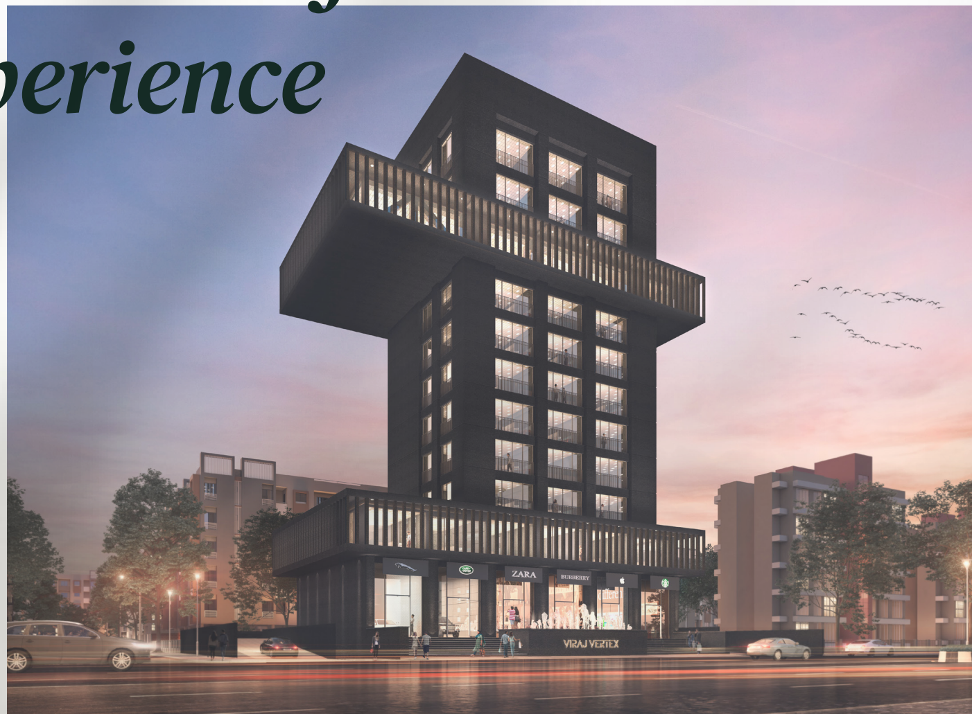
Viraj Vertex Corporate Office

Viraj Estates is set to redefine the luxury housing sector and commercial spaces of Nashik City. Viraj Estates ventured in land development over four decades ago. The company was majorly into the creation of land layouts, providing plots to end users for residential projects / Townships and commercial activities. While along the way dabbling into few stand-alone construction projects in some of the prime locations in Nashik City.