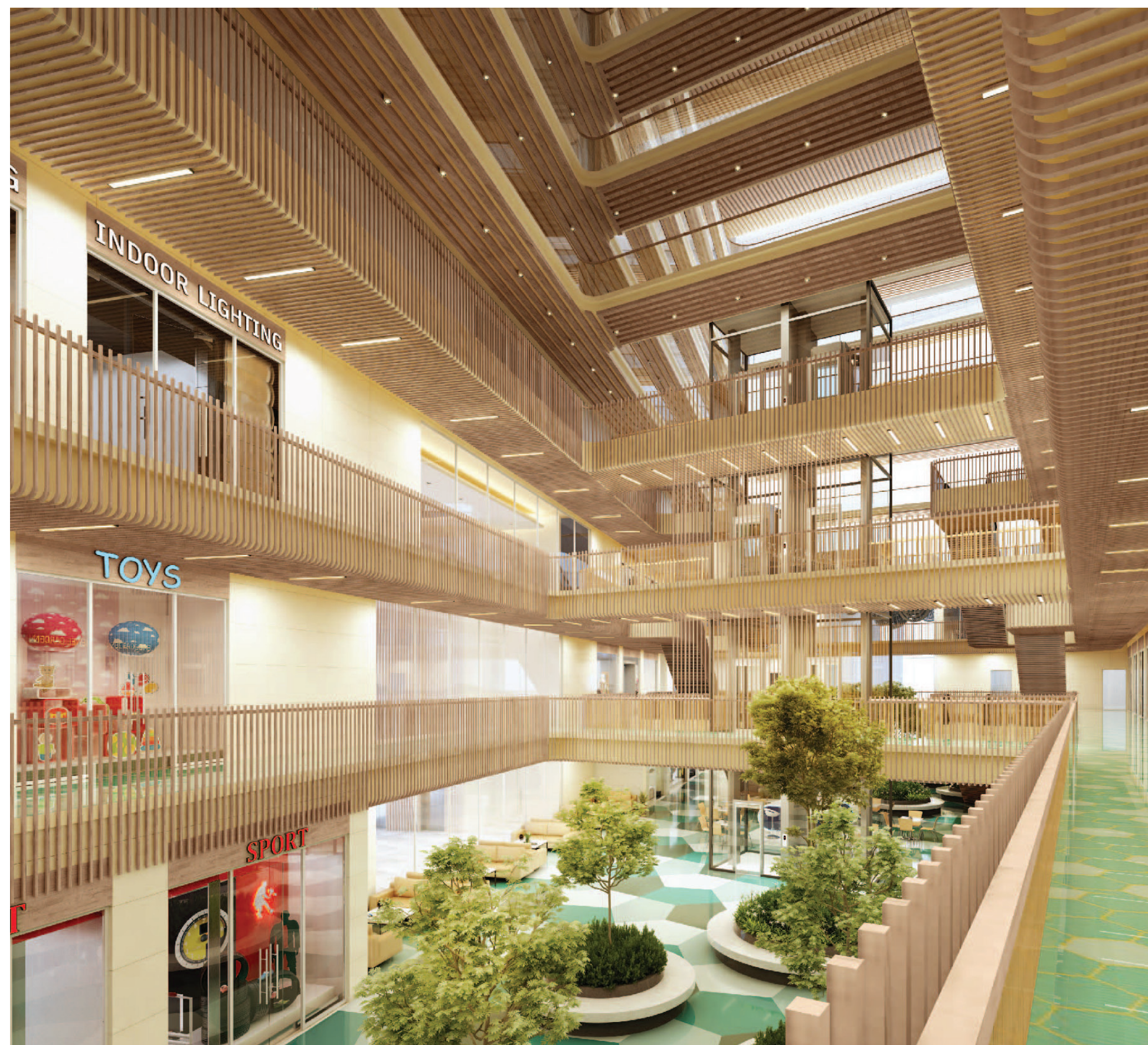
First Floor Atrium